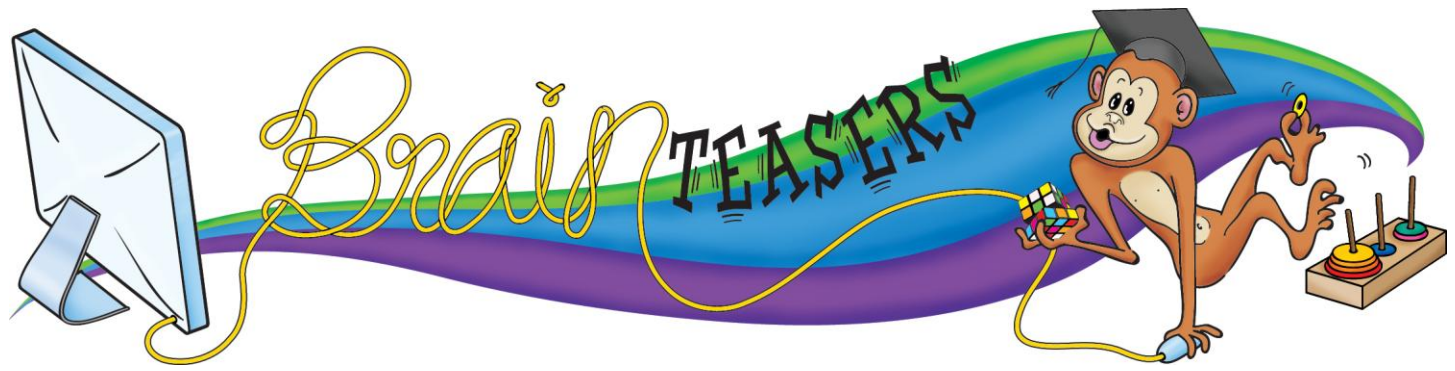
Puzzle provided by Kordemsky: The Moscow Puzzles (Dover)

Make a square with 9 dots as shown. Cross all the dots with 4 straight lines without taking your pencil off the paper.